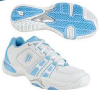
Light tennis shoes

the goal of any portrait session is to direct the viewer's attention to the face of the subject.