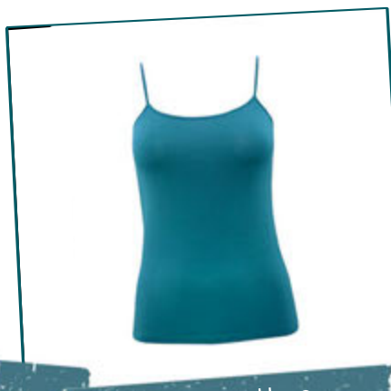
Tight Cotton Tank Tops